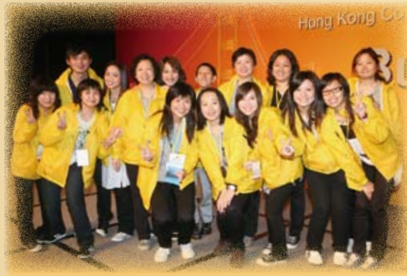
Staff Photo at Closing Ceremony