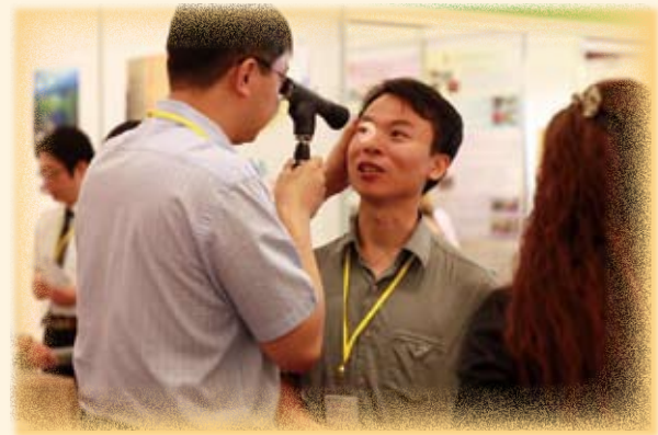
Off-Shot at Exhibition Booth