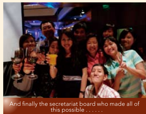
And finally the secretariat board who made all of this possible . . . . .

"Submissions of articles to After Hours with up to 500 words are always welcome. Email: terlee@hkcfp.org.hk "