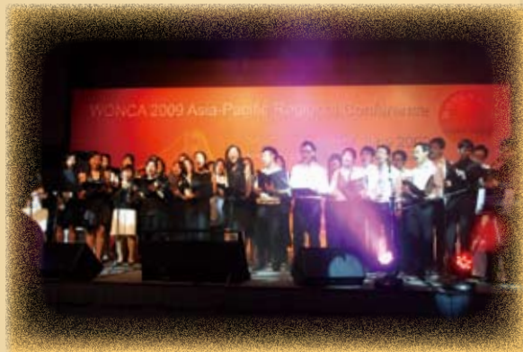
Off-Shot during Opening Reception