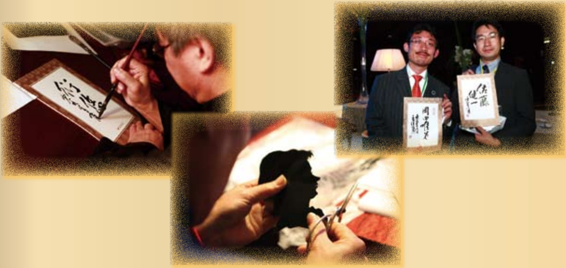
Entertainment during Opening Reception