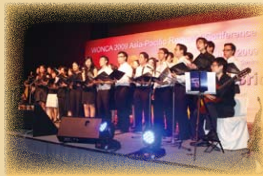
Singing performance by Family Medicine Trainees