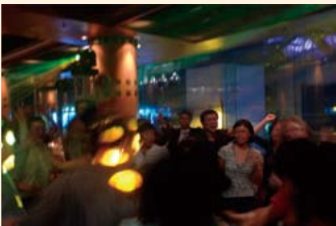
We've always thought the examiners were a bit crazy . . . now we've got proof!!

The atmosphere was so contagious that our other hired band refused to stop despite their contractual time and the catering staff even joined in! We sure did show that Family Medicine Doctors rock inside AND outside of their white coats!