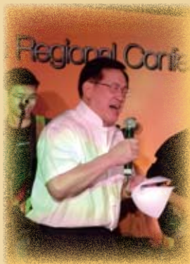
▲ Dr. York Chow