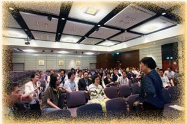
Off-Shot at Scientific Programme