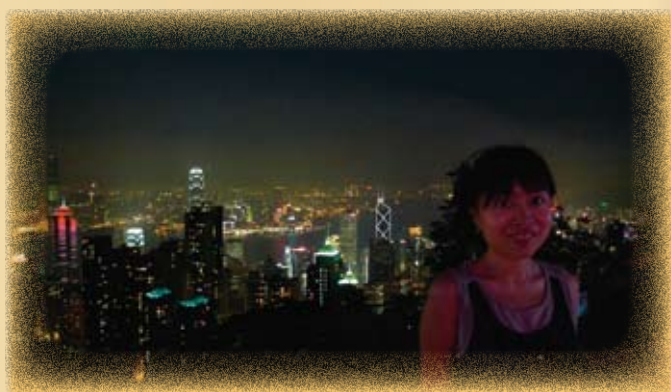
Working hard by day, and playing hard at night