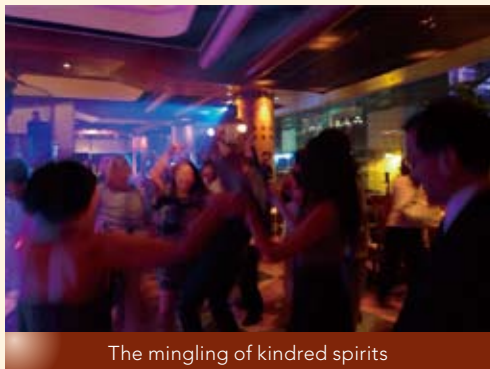
The mingling of kindred spirits

Apart from showing the true Hong Kong spirit, the Conferment Party captured the true essence of WONCA. For those of you out there who still think WONCA is all about papers and presentations, it's actually about the sharing and conglomeration of Family Doctors from all over the world.