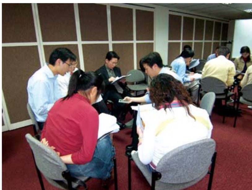
Discussing Cases in the Assessment Enhancement Course

There was an increasing number of candidates over the years. I would like to send my deep gratitude to all tutors for their help and genuine sharing. They have given their time as unknown heroes and uphold the spirit of cooperation and support among colleagues. In the future, we hope to recruit more enthusiastic tutors, anticipating that the course will accept more candidates sitting for different examinations in Family Medicine, such as DFM, as well as other non-vocational trainees and practitioners, either local or overseas, who would like to enhance their skills and knowledge in primary health care.