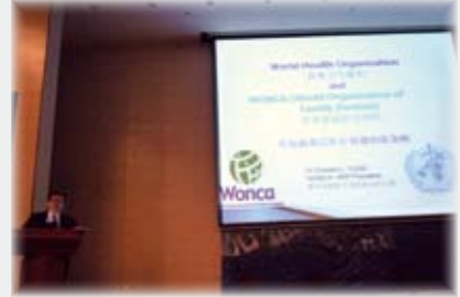
Making my presentation