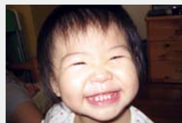
17 months now! Likes the camera very much