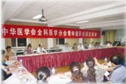
Young society of GP