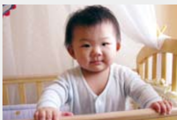
8 months old, standing straight with support