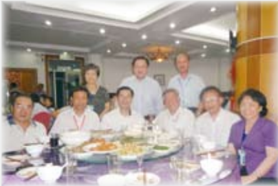
With key people including guests from Macau