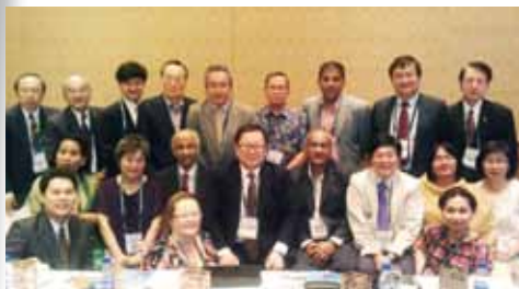
The WONCA APR Council executives

In the meeting, our College was commended for the timely organization of our first Hong Kong Primary Care Conference (HKPCC) to be held on 28 – 29 May 2011 that is relevant to the much broader primary care community. This conference will provide a platform to share the latest scientific updates, current development and future trends in primary care, and to allow all members of the primary care team (family physicians, nurses, community and allied health practitioners) to network and learn from one another. The theme of this inaugural conference is "A New Frontier" to provide a new frontier for the fields of primary care, by bringing experts and practitioners together and encouraging future development and collaboration.