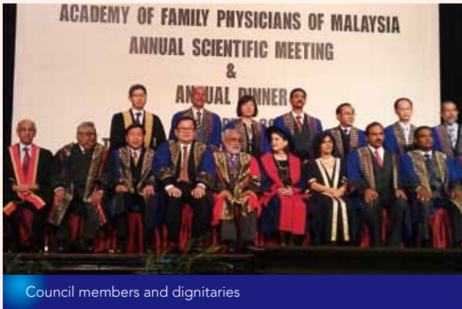
Council members and dignitaries