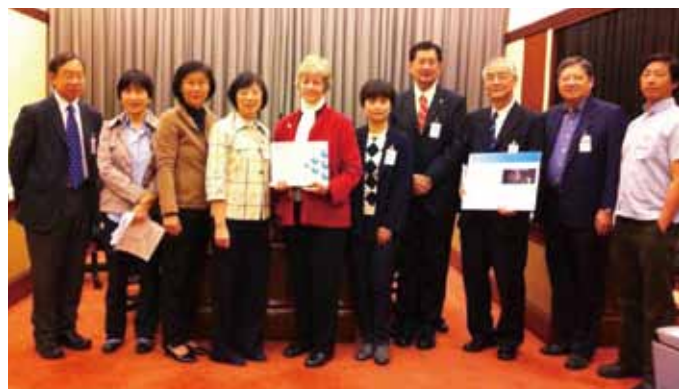
Legislative Council Public Revenue Protection (Dutiable Commodities) Order 2011 representing both the HKAM and our College

Tobacco smoke contains over 4000 chemicals and over fifty of them are carcinogens. Nicotine also stimulates our central nervous system and causes addiction. The top five leading causes of death in Hong Kong are all caused by smoking. Tobacco kills one in two