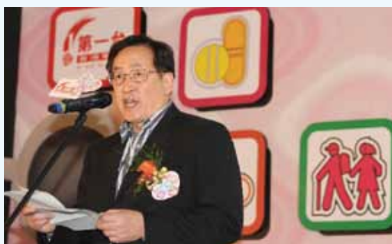
The Secretary for Food and Health, Dr. York Chow, called on the public to team up with healthcare professionals as partners in health.

During his address at the launching ceremony, the Secretary for Food and Health, Dr. York Chow said the Campaign would help deepen public understanding on how people can team up with healthcare professionals as health partners. He also reaffirmed the Government's commitment to promote primary care in Hong Kong.