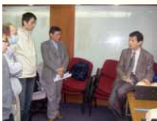
Women’s Health Workshop