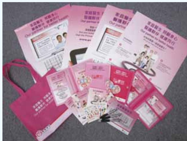
Publicity and health education materials on primary care.

Radio coverage of the Ceremony was broadcast on RTHK Radio 1 on 27 April 2011. Please visit the following link and enjoy the show. ( http://programme.rthk.hk/channel/radio/programme.php?name=/adwiser&d=2011-04-27&p=1147&e=138711&m=episode )