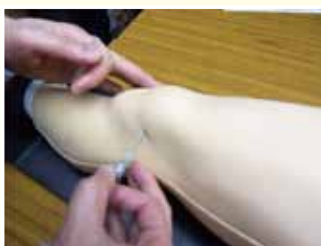
Orthopaedic Injection Workshop