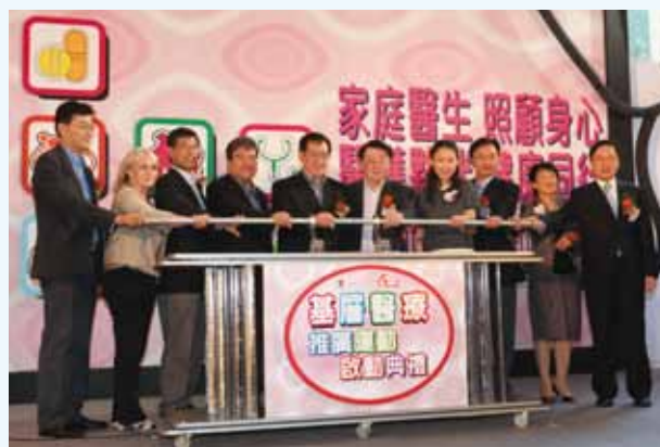
The officiating ceremony symbolised the roll-out of the Primary Care Campaign.