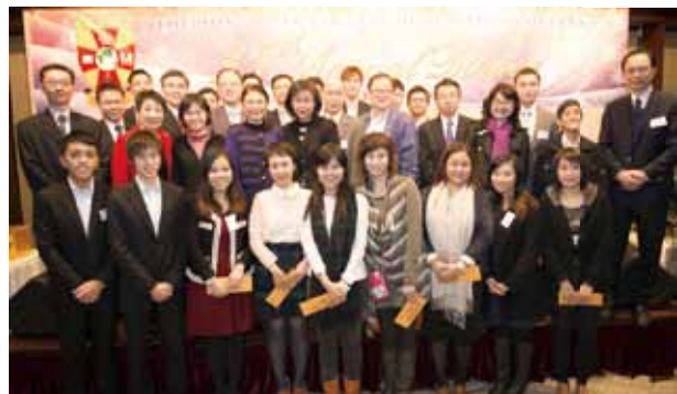
Council members and staff