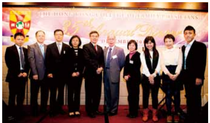
Members and Staff of Board of Professional Development and Services