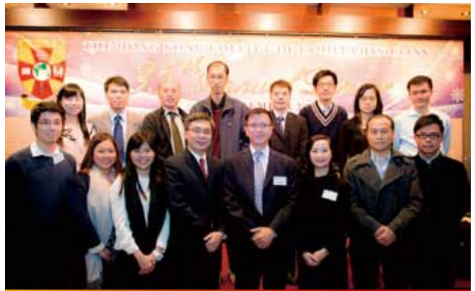
Group Photo of Successful Conjoint Examination Candidates