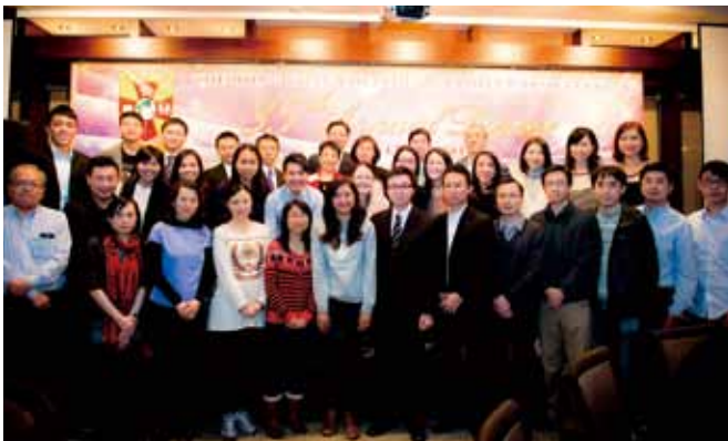
Group Photo of Successful Exit Examination Candidates