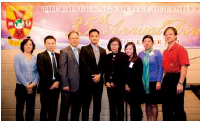
Members and Staff of Editorial Board