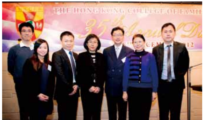
Members and Staff of Board of Vocational Training and Standards