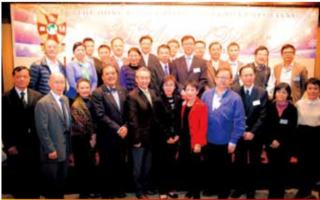
Distinguished guests and College officials