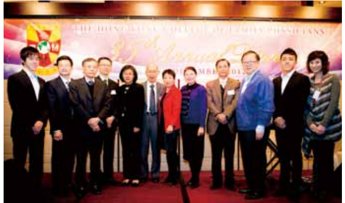
Members and Staff of Board of Diploma in Family Medicine