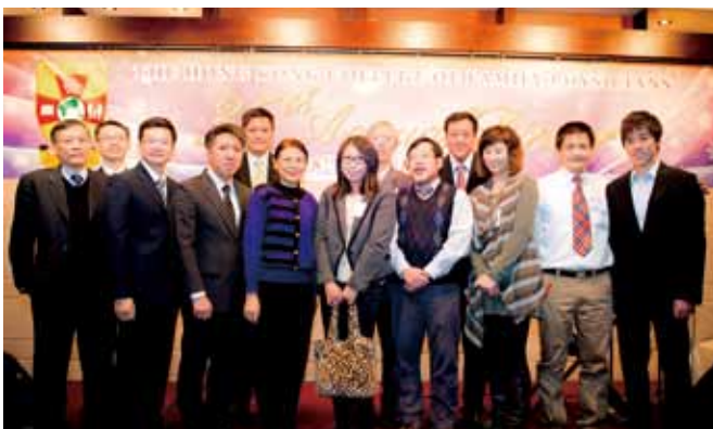
Members and Staff of Board of Education