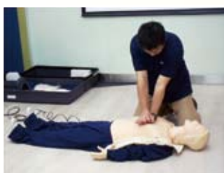
CPR Training Workshop

#Cantonese and English will be used as the language for teaching and examination.