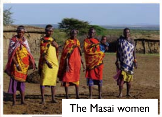
The Masai women