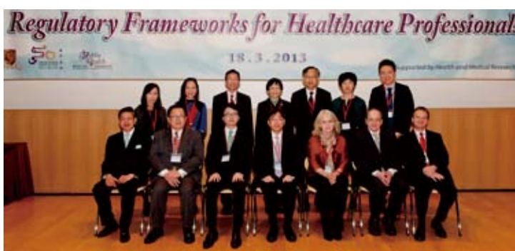
Group photo of the symposium