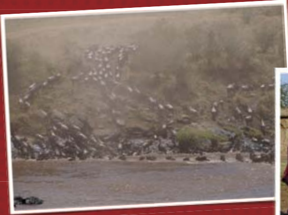
Wildebeest crossing the Mara River.