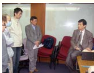
Women's Health Workshop