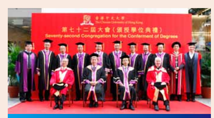
Seventy-second Congregation for the Conferment of Degrees