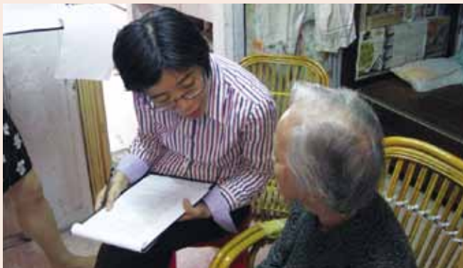
Cognitive assessment at home by home visit scheme for singleton elderly >=70 years (Jockey Club programme)