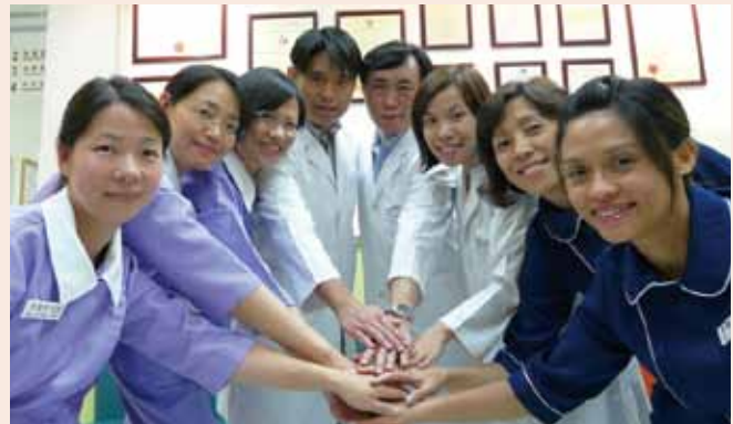
Team approach to primary care

IHCS of UCN provides home care services to elderly, disabled and needy in Tai Po.