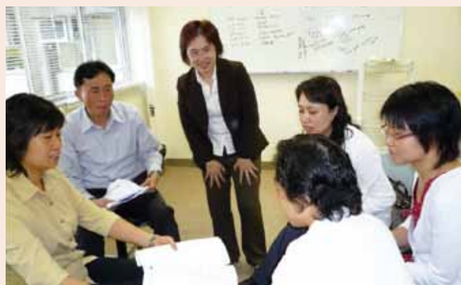
Team building with Preventive Medicine and Clinical Services Department

Within the five medical clinics, UCN currently has 13.44 medical doctors at full-time equivalence, four of whom are specialists in Family Medicine. The clinics are situated in community health centres in Kwun Tong, Lam Tin, Yaumatei, Tai Po and Tin Shui Wai. As UCN's work has a large preventive element, each doctor divides his/her time between conducting the regular Family Medicine clinic and the preventive health check service. These two services run in parallel for logistics reasons, but the nature is integrated. The four larger clinics are group practices, with four to five doctors each. In addition, the doctors are supported by registered nurse, registered dietitian, physiotherapist, dispenser, and trained health workers. All UCN doctors and dentists are registered in the primary care directory.