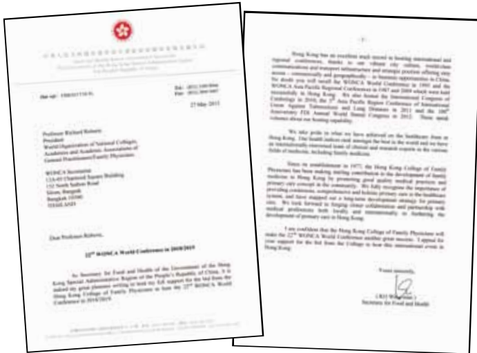
Support from our Secretary for Food and Health Bureau, Dr. Ko Wing Man

The Hong Kong Tourism Board has helped us produce a video which can be viewed on the College website, YouTube, and Facebook; arrange staff to support us in Prague; organise and fund lion dance, Tai Chi, and the Prague Chinese International School choir performance. I am deeply grateful to our Chief Executive, Mr. C Y Leung; Secretary of Food & Health Bureau, Dr. Ko Wing Man, and the Hong Kong Tourism Board for their tremendous support in our bidding.