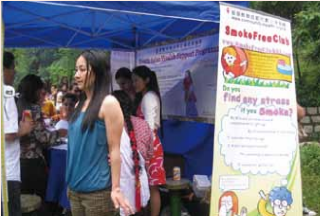
Quit smoking promotion in the field