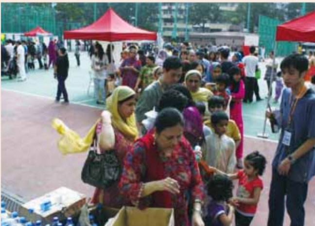
Health promotion in the community