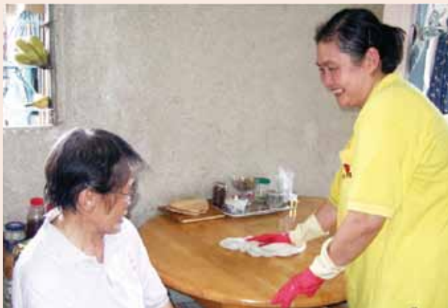
Integrated home care service (SWD programme)