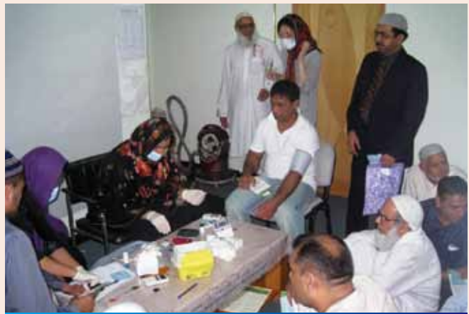
Ethnic minority outreach health screening (Community Chest programme)