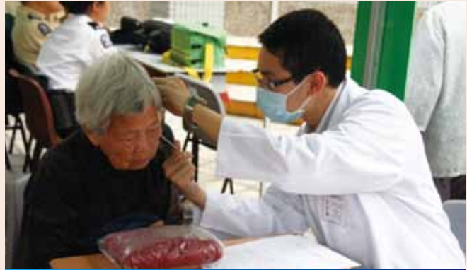
Chinese medicine in the community

Through the special health programmes and collaboration with other NGOs and community groups, UCN clinics enable and encourage the more vulnerable members of the community to present for care. For example, the Ethnic Minority Health Programme has attracted a number of Pakistani and Nepalese women to come for women's health check in a culturally sensitive environment; and the Driver's Health Programme has pushed forward the promotion of men's health.