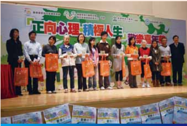
Positive psychology education in the community