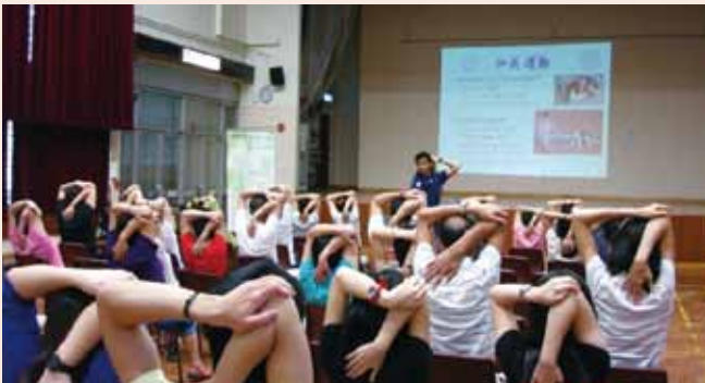
Stretching exercise demonstration in the community