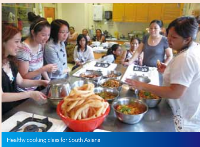
Healthy cooking class for South Asians

At present, UCN has five Family Medicine clinics, seven traditional Chinese medicine clinics and five dental clinics, as well as a range of health programmes to promote health and prevent disease through empowerment of individuals for self-reliance in developing a healthy lifestyle and community involvement to achieve a higher level of wellness.