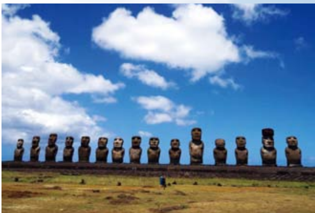
Easter Island, Chile