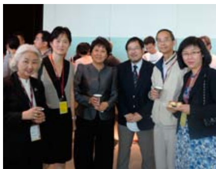
Guests attending the seminar

THE HONG KONG COLLEGE OF FAMILY PHYSICIANS