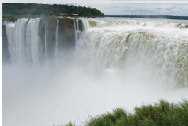
Iguazu Falls at Argentina side