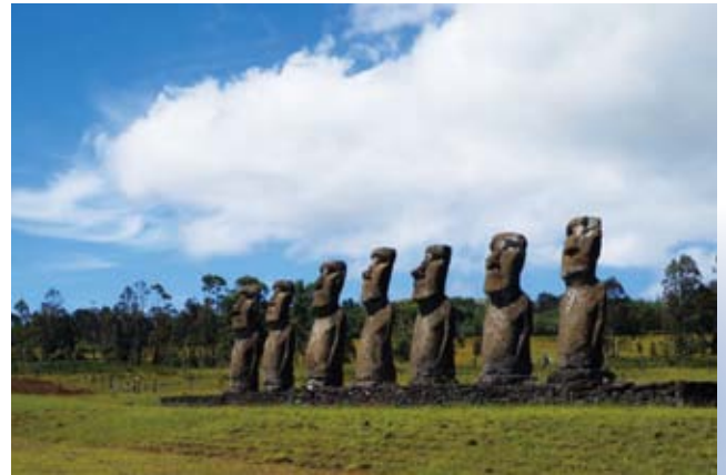
Easter Island, Chile