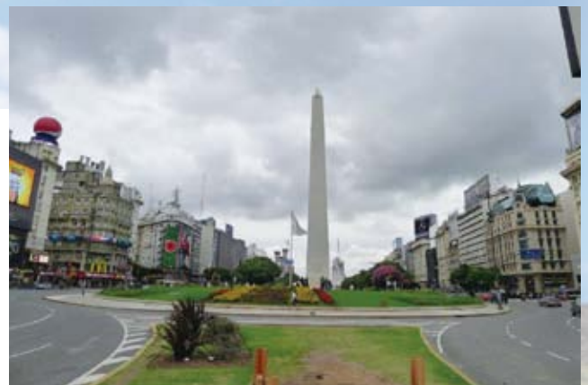
Buenos Aires, Argentina