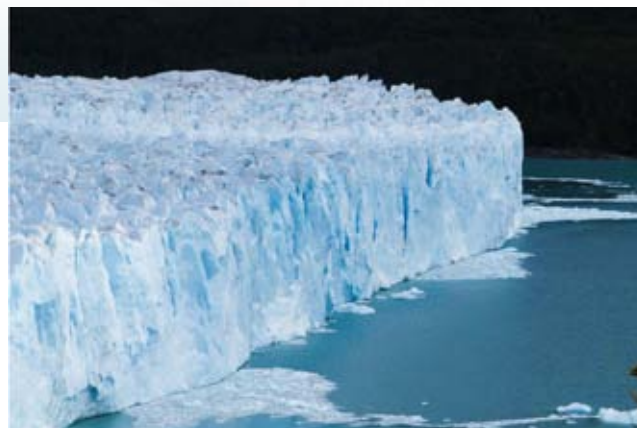
Perito Moreno, near El Calafate, Argentina