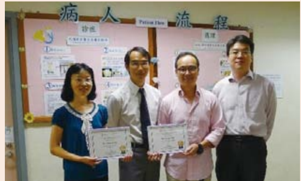
This photo is put in my consultation room (our clinic group photo with the award of 1 st runner up in KPI in NTW cluster). It is my "visual anchor". Every time I take a look of this photo will elicit my positive flow state

Because any state either positive or negative can be triggered among us, we must disconnect from any strongly negative state first before using your trigger.