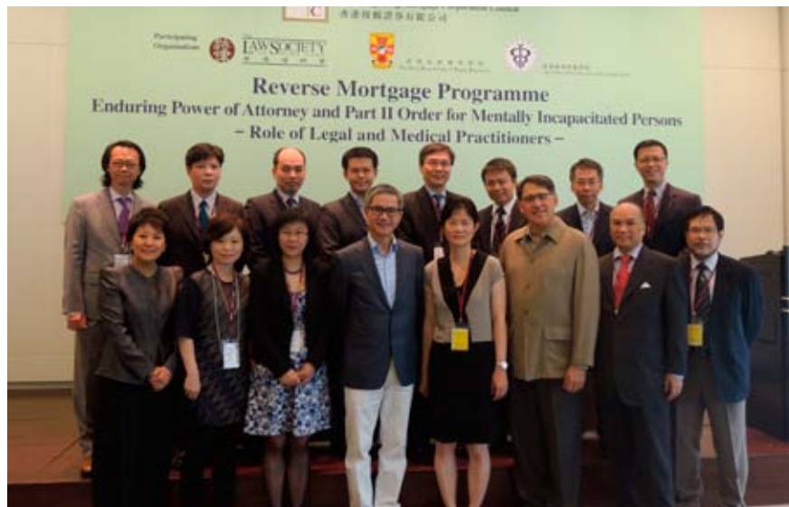
Group photo of organizers and invited guests

On July 28, 2013, a beautiful Sunday afternoon, the Hong Kong Mortgage Corporation Limited (HKMC), the Law Society, the Hong Kong College of Psychiatrists (HKCPsych) and our College jointly held a seminar "Reverse Mortgage -Enduring Power of Attorney (EPA) and Part II Order for Mentally Incapacitated Persons" at the Hong Kong Monetary Authority. The seminar provided both the legal and medical practitioners with an overview of the legal and medical requirements relating to the arrangement for an EPA under the Enduring Powers of Attorney Ordinance and the application for a Court Order ("Part II Order") under Part II of the Mental Health Ordinance.