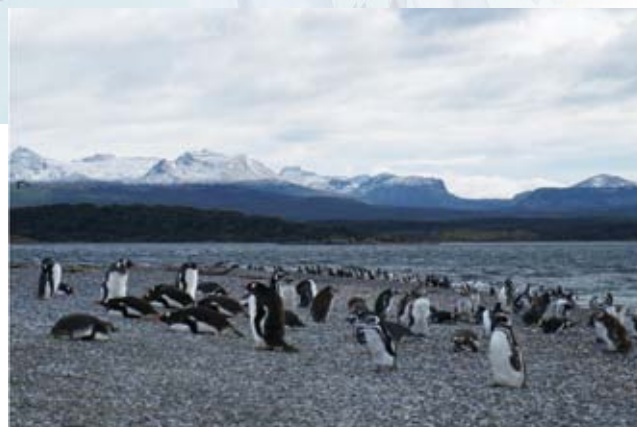
Martillo Island, Argentina