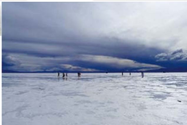
Salinas Grande (Salt Flat), Argentina