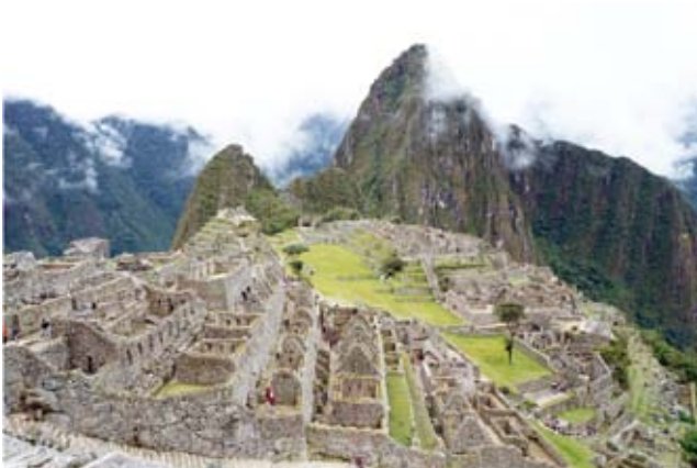
Machu Picchu, Peru