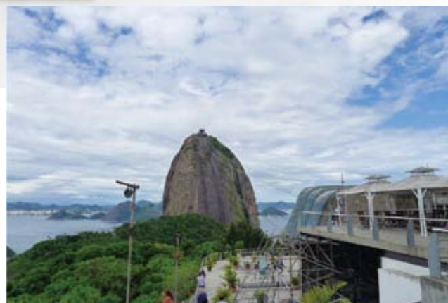
Sugar Loaf, Rio de Janeiro, Brazil