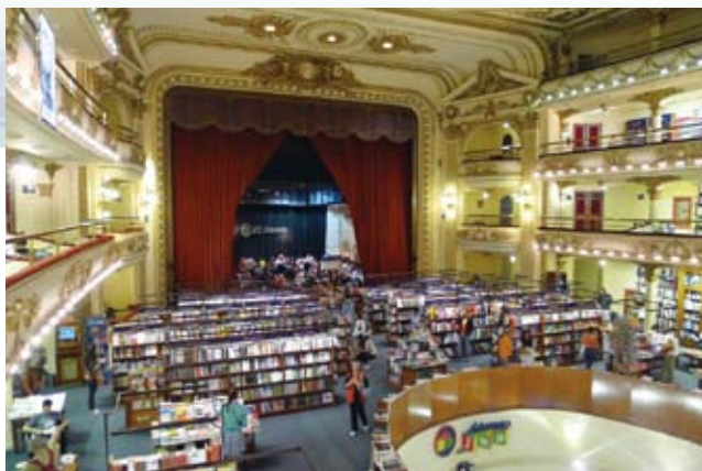
El Ateneo Grand Splendid, Buenos Aires, Argentina – a bookstore which was converted from a theatre