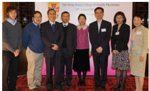
Members and Staff of Board of Diploma in Family Medicine