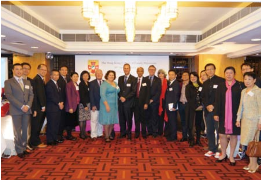
Invited guests and Council members