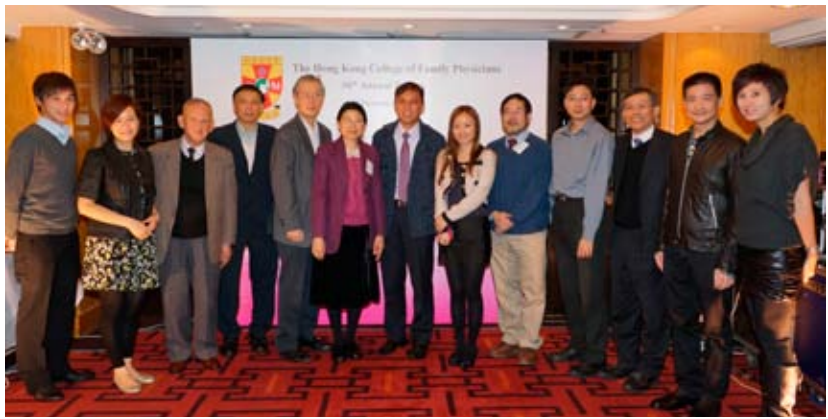
Group Photo of Pharmaceutical Companies' representatives and the Board of Education