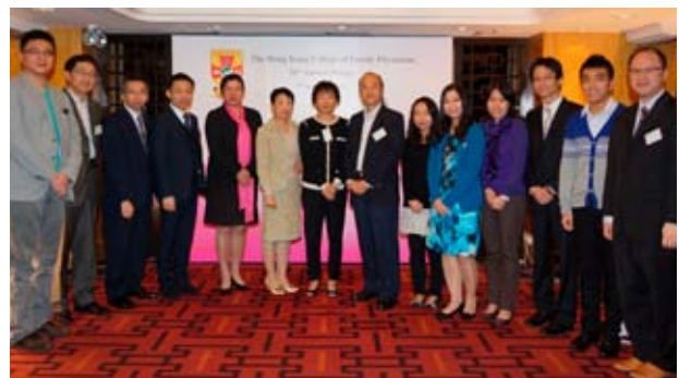
Group Photo of Exit Examination Successful Candidates with the Specialty Board