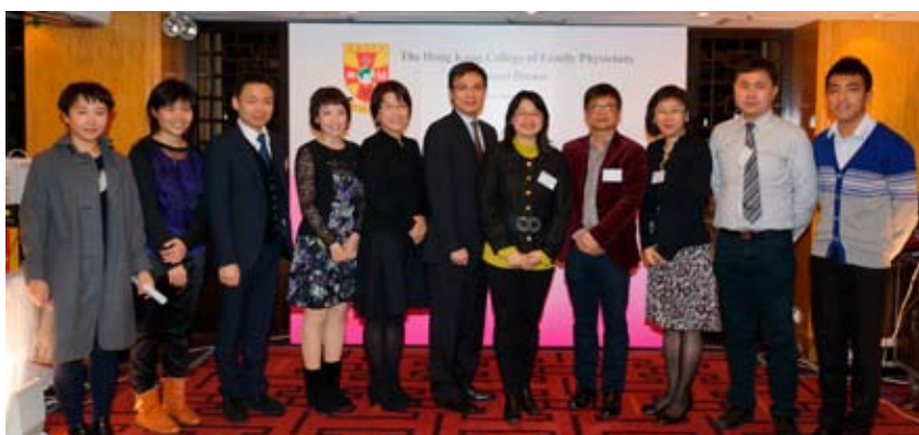
Members and Staff of Hong Kong Primary Care Committee