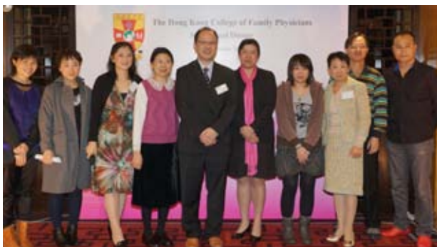
Members and Staff of Editorial Board