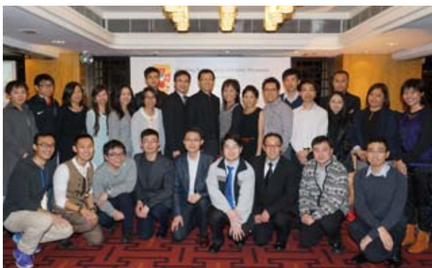
Group Photo of the Conjoint Examination Successful Candidates