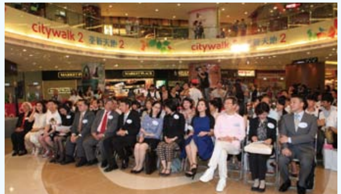
VIPs were seated at the ceremony.