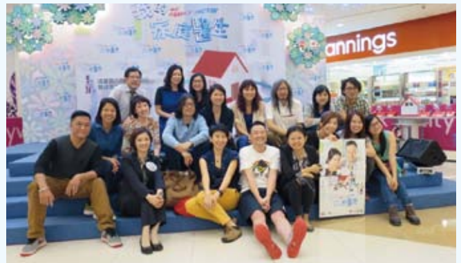
Group photo of the RTHK drama series production team and HKCFP members.