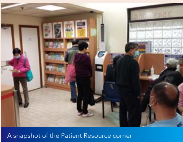
A snapshot of the Patient Resource corner