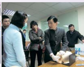
Women's Health Workshop