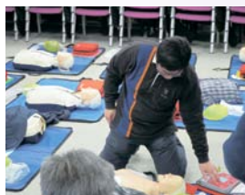
APCLS Training Workshop

*Course syllabus and schedule may be subject to change without prior notification