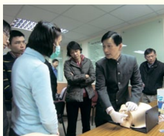
Women's Health Workshop