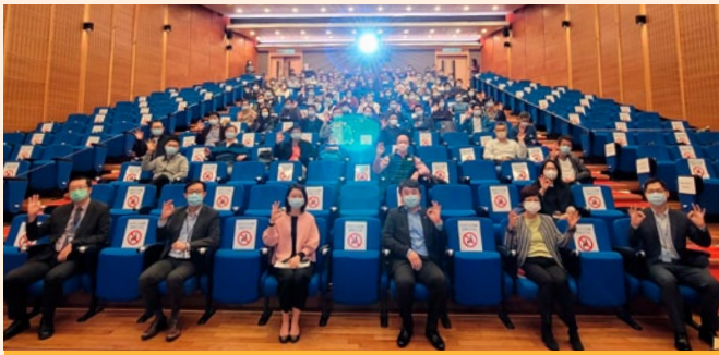
Training for doctors on 19 Feb 2021