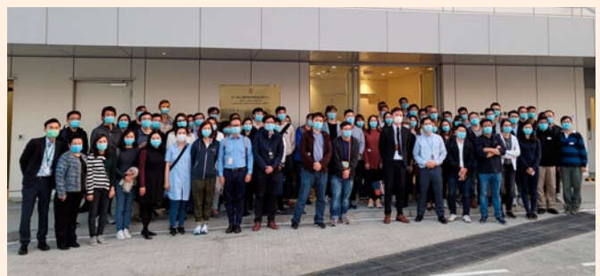
HKICC on-site familiarization