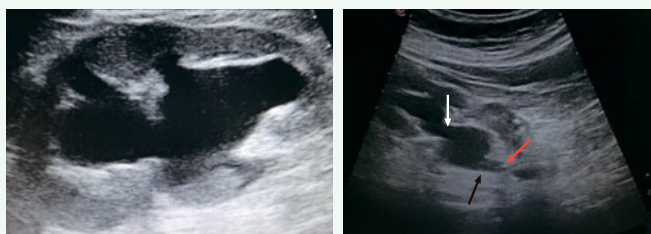
Image E: dilated left renal pelvis (white arrow), dilated left proximal ureter (black arrow) and suspicious ureteric stone with acoustic shadow (red arrow).

POCUS (image E) showed left-sided hydronephrosis and hydroureter. A hyperechoic lesion with acoustic shadow, probably a ureteric stone, was detected just distal to the dilatation of the ureter.