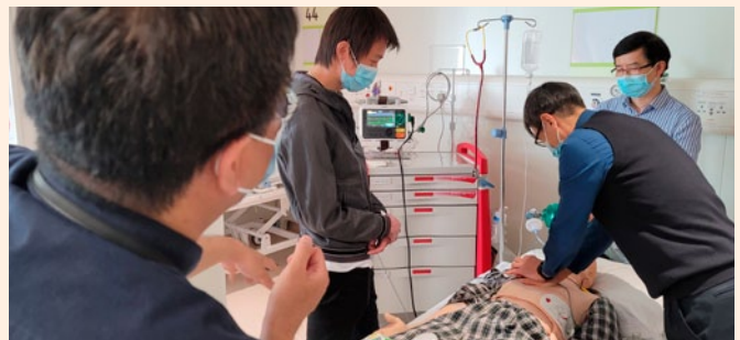
Emergency and Resuscitation Training at HKICC