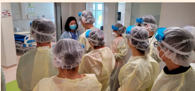
PPE training at HKICC