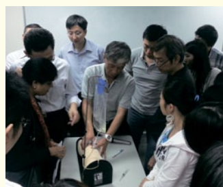
Orthopaedic Injection Workshop