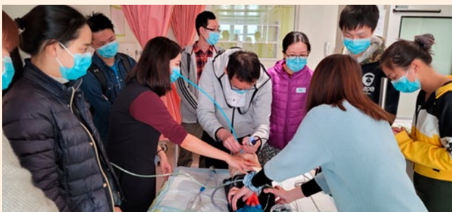
Airway hands-on practice at HKICC