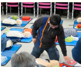
APCLS Training Workshop

*Course syllabus and schedule may be subject to change without prior notification