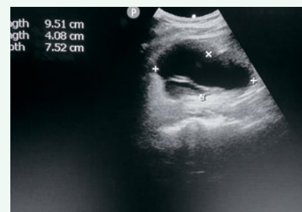
Image L: left kidney cyst with septum and possible soft tissue component

The overall impression was renal cell carcinoma (RCC) of the right kidney. The patient was issued an urgent referral to Urology Department. He was finally seen by Urologist within 2 weeks afterwards. Private PET-CT scan was arranged, and the tentative plan was to perform laparoscopic radical nephrectomy.