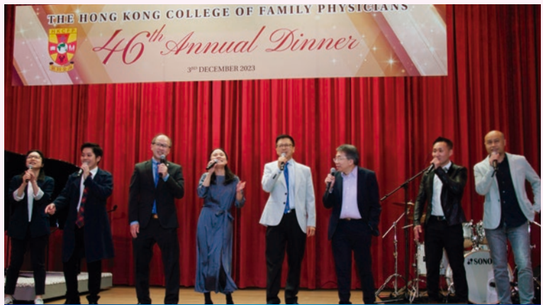
Council members and guests were invited to sing on stage