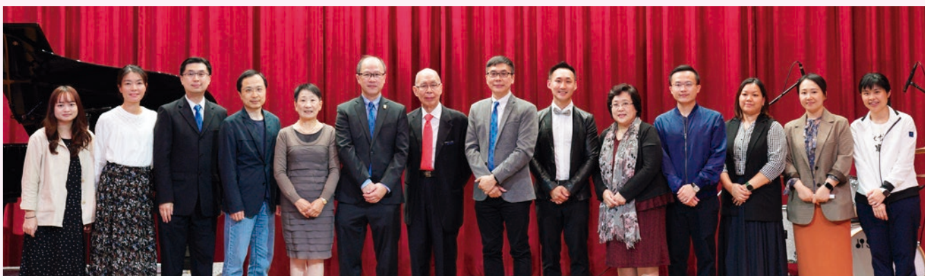
President and Censors took a group photo with members and staff of the Hong Kong Primary Care Conference Organizing Committee