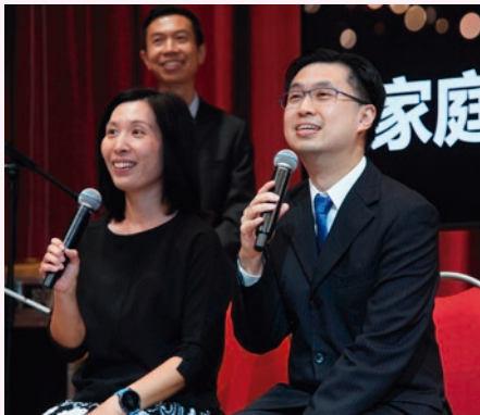
Snap shot of the "Big TV" game