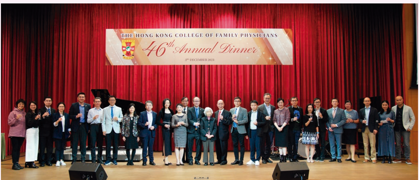
Council Members with distinguished guests on stage