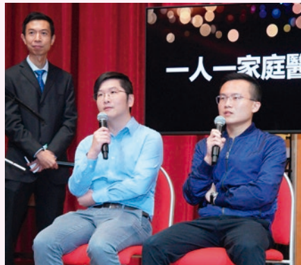
Snap shot of the "Big TV" game