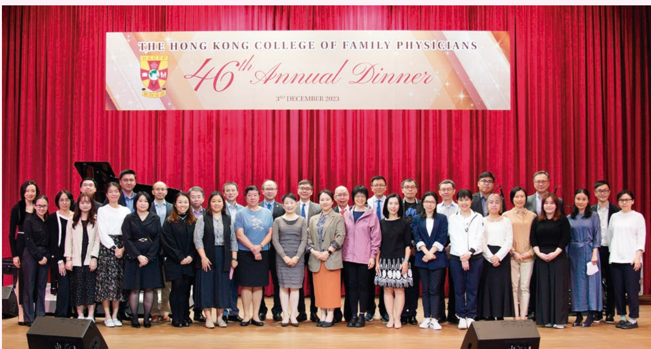
Censors and Council members took a group photo with Secretariat staff