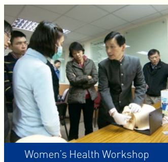
Women's Health Workshop