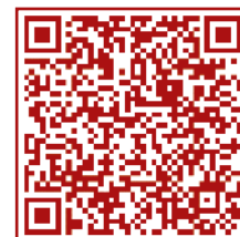
Registration QR Code