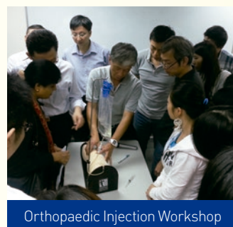
Orthopaedic Injection Workshop