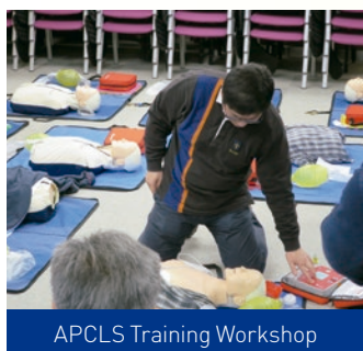
APCLS Training Workshop

*Course syllabus and schedule may be subject to change without prior notification