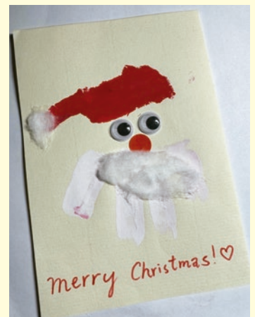
Appreciation card from one patient

On reflection, this Christmas Carol event, meticulously organized by the Young Doctors Committee of HKCFP, served as a beacon of happiness for patients in the hospitals, particularly the children in paediatric wards. It provided a much-needed break from the monotony and challenges of their hospital stay, infusing the atmosphere with a profound sense of joy and celebration. The event aimed to uplift the spirits of patients, especially during the holiday season when separation