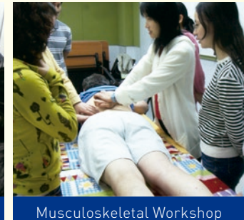
Orthopaedic Injection Workshop