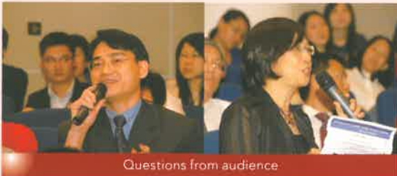
Questions from audience

From observation of the proceedings and subsequent feedback from participants and attendees, the aim of the symposium to engage academic colleagues and fellow health care professionals in constructive debate and discussion about the way forward for primary care in Hong Kong was overwhelmingly achieved. A summary document of recommendations based on the discussions raised in this symposium will be presented to government for consideration and hopefully it will contribute to real progress.