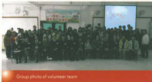
Group photo of volunteer team

"The beauty of life does not depend on how happy you are... But on how happy others can be because of you" ~ George Carlin