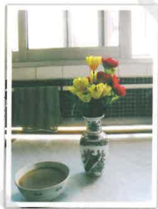
Little gifts bringing heaps of warmth and cheers to the elderly

This program has been established for 10 years, but this was the first time for me to participate in voluntary home visits. It was a completely different experience from my previous visits to the institutionalized elderly as a community geriatric ambulatory team (CGAT) doctor. This home visit campaign targeted mostly the elderly who were living alone with chronic illnesses and in need of community support services due to difficulty in ambulation. We brought them steaming home-made soup, hand-made woolen clothing, thick blankets and bouquets of beautiful flowers donated by charitable organizations and individuals.