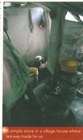
A simple stove in a village house where tea was made for us.

We were blessed with the chance to join volunteer work in Tai Po organized by the Social Welfare Department and the Salvation Army. Warmth in the Breeze (風中暖流) is a program aiming to send warmth and love to the elderly in the community by direct home visits. We were grouped with social workers, community volunteers, medical/ nursing students, physiotherapists, occupational therapists and doctors. By performing direct home visits, we can have a better understanding of the difficulties encountered by the local elderly and offer tailor-made and immediate help to them. It may be something as simple as sending more blankets and clothes to them, or directly teaching them how to use their own electronic sphygmomanometer for home blood pressure monitoring.