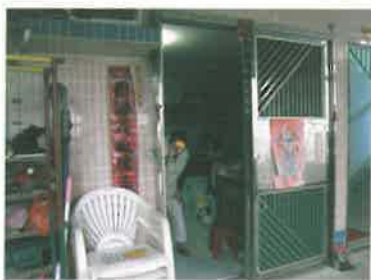
This lady was living alone on the ground floor of a village house, but was able to gain good family support as her son is residing on the floor above.

Our community health care teams are composed of professionals and students from medical, nursing and social work fields as well as volunteers from the community. By combining our expertise, each of us was able to obtain different perspectives and gain a good understanding of the physical and psychosocial condition of the elderly. I felt that home visits were especially relevant to me as a family physician as I can get to know the person as a whole – his coping skills in daily life, level of self care, pastimes, home environment, the surrounding community and his family.