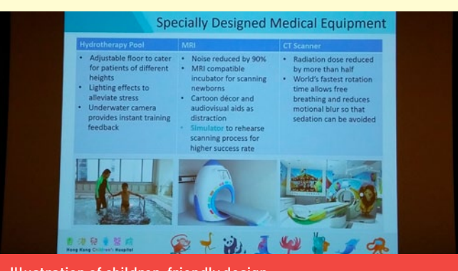
Illustration of children-friendly design

HKCH is also a dedicated centre of excellence in clinical, teaching and research. The new hospital has been devoting resources in setting up a Clinical Simulation Centre, with aid of technology and real-life scenarios to enhance clinical skills of frontline staff including medical, nursing, and allied health colleagues for handling emergency and complex situations in paediatrics. One of its main focuses is paediatric transport medicine, as the HKCH is planning a first ever inter-hospital escort team within the Hospital Authority, to dispatch HKCH staff