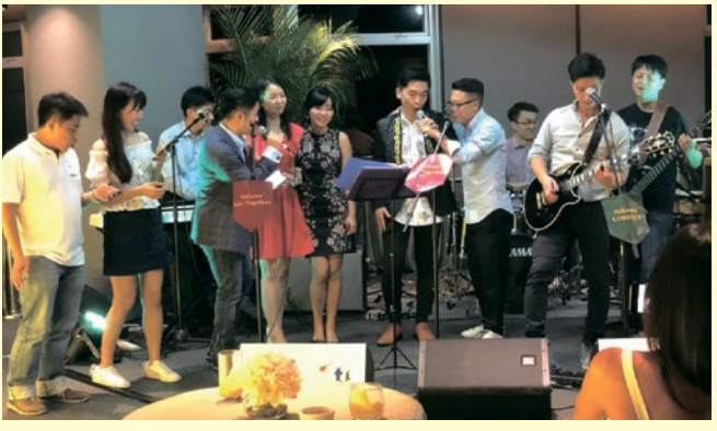
Jam band performance

We look forward to our next performance at the end of this year. We need your support and "LIKE". Please join our College's Annual Dinner at the year end. Finally, our band, FM<sup>2</sup>, would continue to bring you cheerful, romantic, energetic and relaxing music!