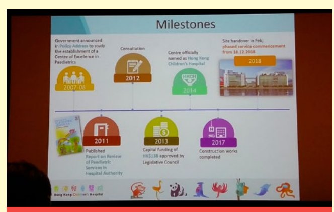
Milestones for HKCH