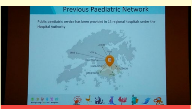
The hub-and-spoke model of HK Paediatric service

HKCH is a tertiary hospital located in Kai Tak development area, serving paediatric patients with complex conditions. In the first phase of service, the HKCH takes appointments from oncology (Prince of Wales Hospital and Queen Mary Hospital), nephrology (Princess Margaret Hospital), and receives patients identified in the newborn screening programme for inborn errors of metabolism. To cope with the complex nature of the conditions, HKCH is equipped with specially designed hardware, in addition to creating a more children-friendly environment. The first stop for